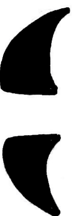
BUTTERCUP Cut from black felt